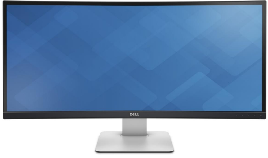
34" Dell Ultrawide - walmart.com

iii. Some areas where displays are currently located or will be located will benefit from a large, ultrawide display from 30" to 42", such as Accounting, Graphics, GIS, and Visio/AutoCAD users to name a few.